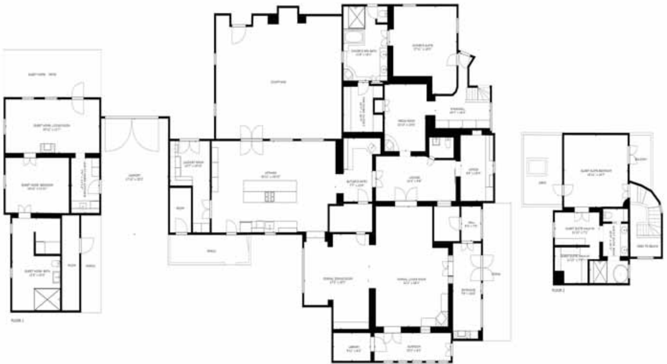
984-C Acequia Madre Floor Plan For Visual Aid Only