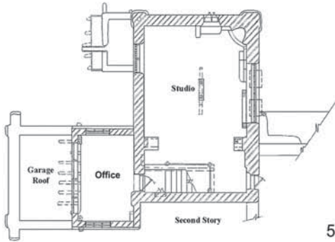
5 Cerro Gordo - Unit 5 & Unit 3 Floor Plan For Visual Aid Only